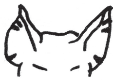
Litter No. 7 Pig No. 7