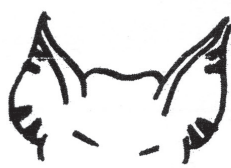
Litter No. 8 Pig No. 8