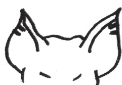
Litter No. 6 Pig No. 6