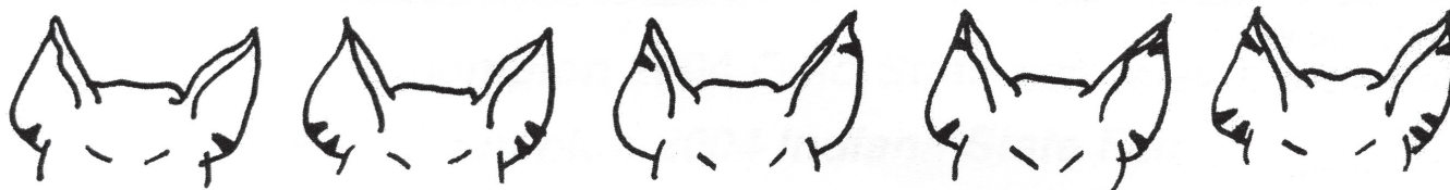
Litter No. 1 Pig No. 1

Use least number of notches to show number.