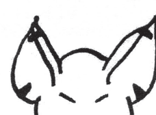
Litter No. 10 Pig No. 10

To avoid confusion when showing the ear notches on a Litter Report Card, or Pedigree Application Card, indicate notches by a single straight line thusly: